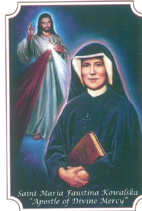
Saint Maria Faustina Kowalska "Apostle of Divine Mercy"

given to Saint Maria Faustina Kowalska Taken from her Diary 'Divine Mercy in My Soul' (Diary reference 1209 to 1229)